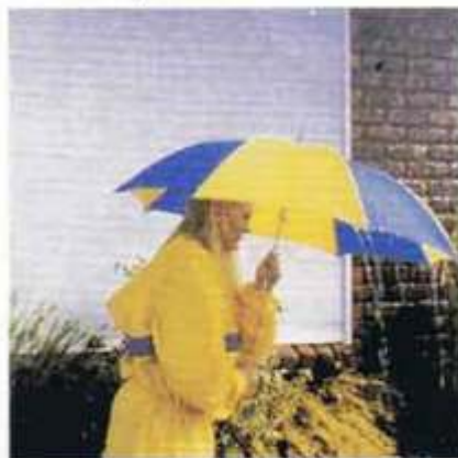
All weather protection

There's a range of fashionable colours to suit your home and you'll never need to paint your Rollita™ Roller Shutters.