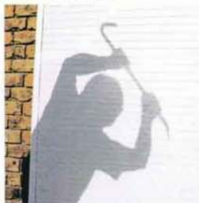
Protection from intruders

interlocking, architectural strength aluminium slats which resist penetration. The internal locking mechanism locks the shutter in position when down. Additional security by the way of a key locking system can be installed if required (optional extra). Outside, the slats are set deeply within the two side channels either side of the window, providing maximum strength and resilience.